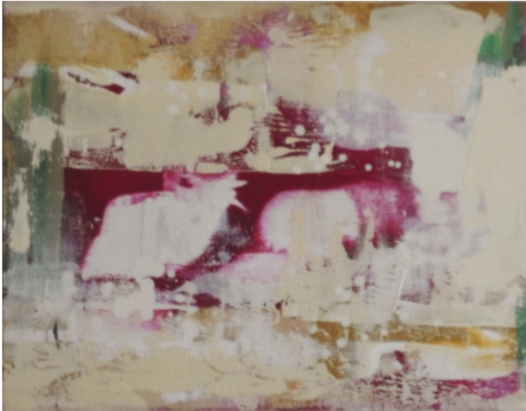
Abstract Painting P/W/B, 32x47,5 cm, acrylic on canvas, 2015, (framed), POA