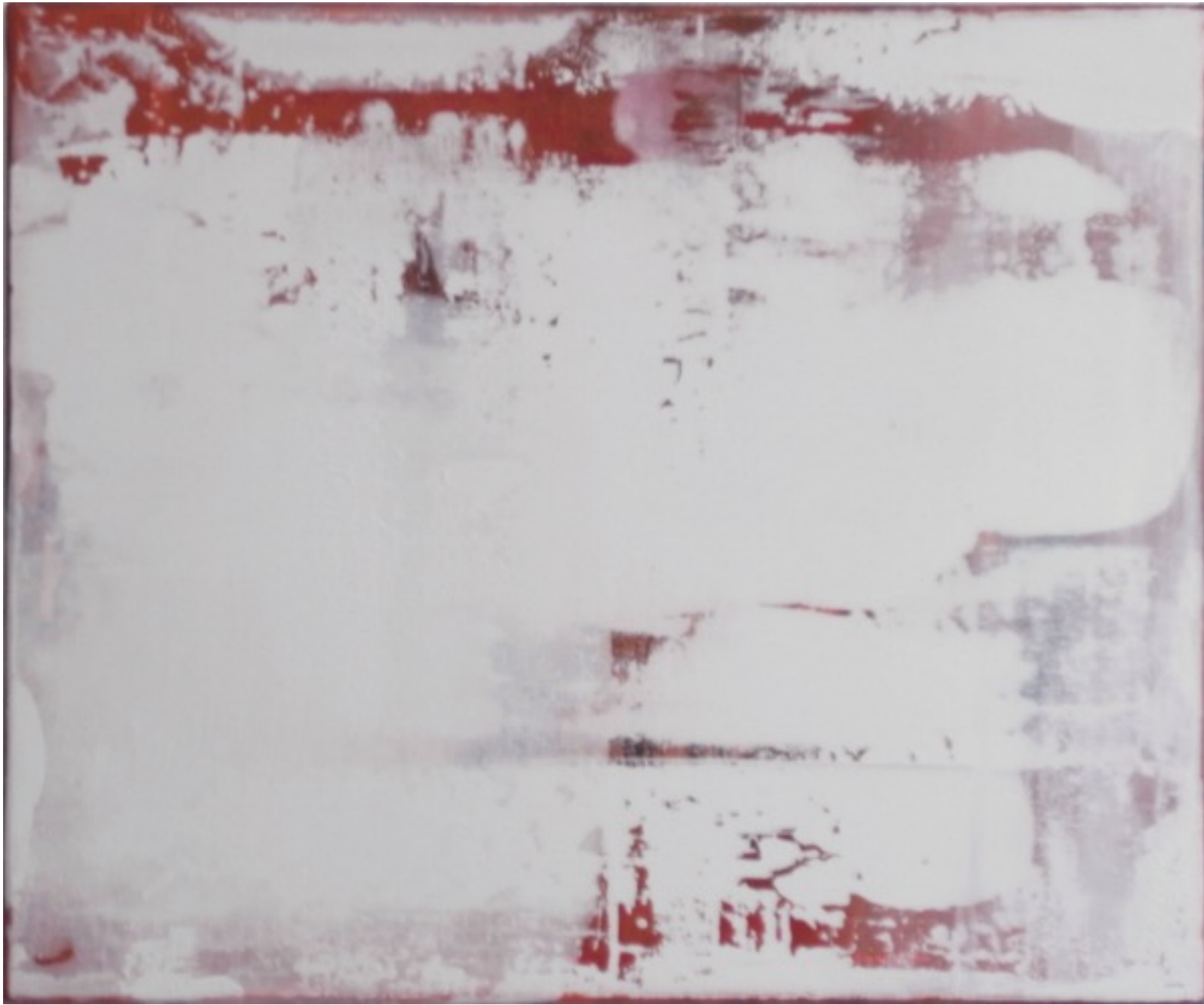
Abstract Painting R/W, 50x60 cm, acrylic on canvas, 2015, POA