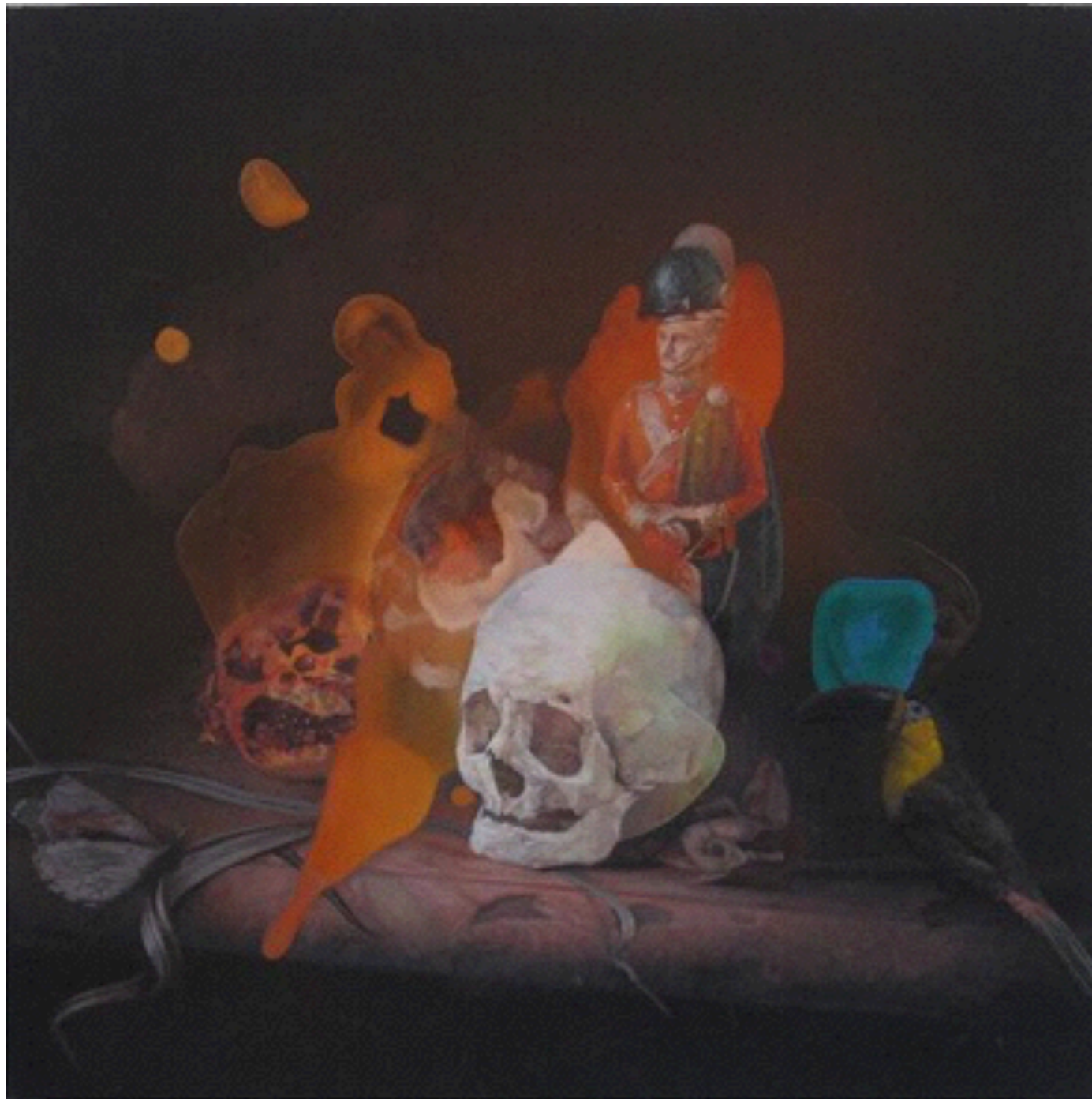
Still Life in Lost Images op.1, 40x40 cm, acrylic and oil on Panel, 2010, POA