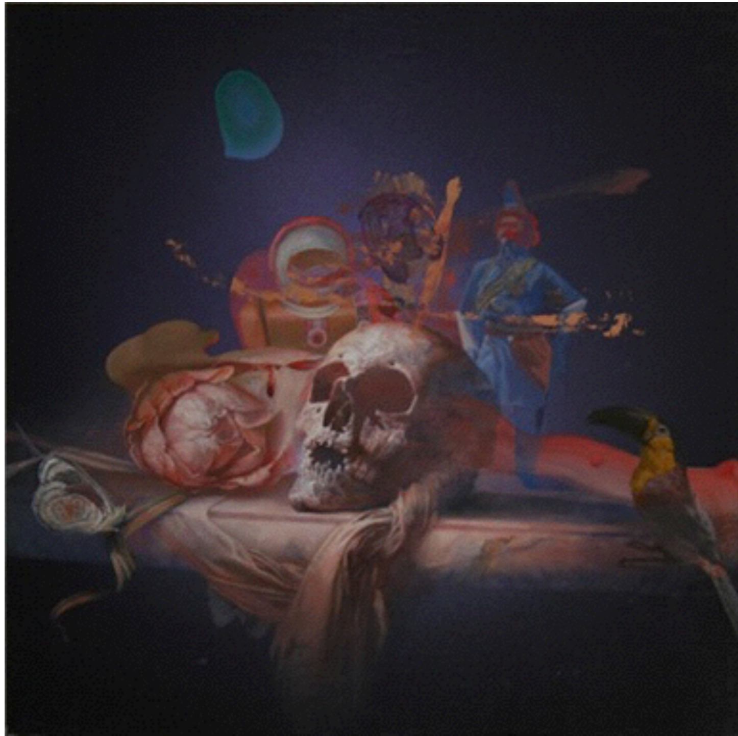
Still Life in Lost Images op.2, 40x40 cm, acrylic and oil on Panel, 2010, POA