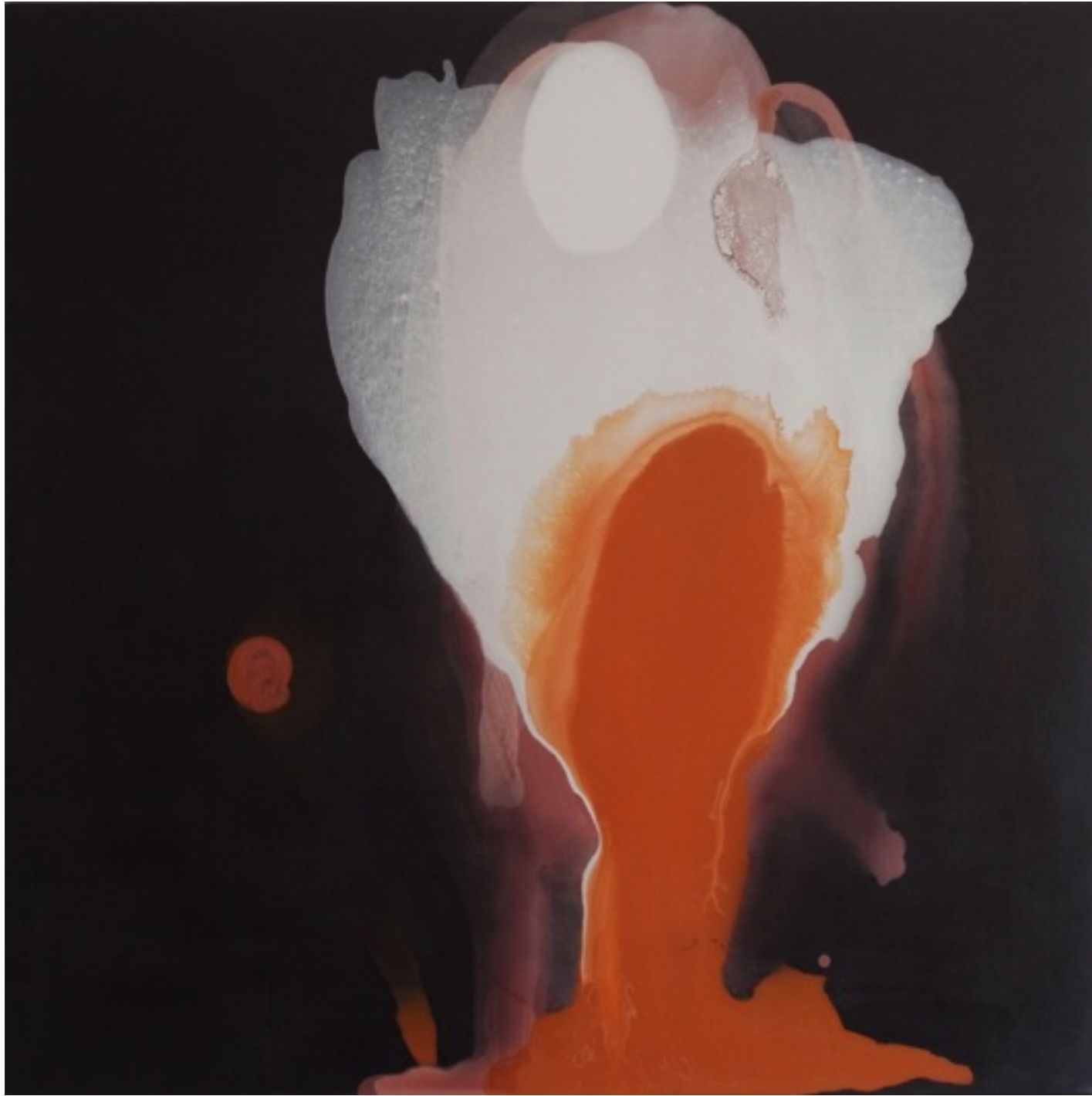
Abstract Painting DB/PF/LF, 85x85 cm, acrylic on canvas, 2015, POA