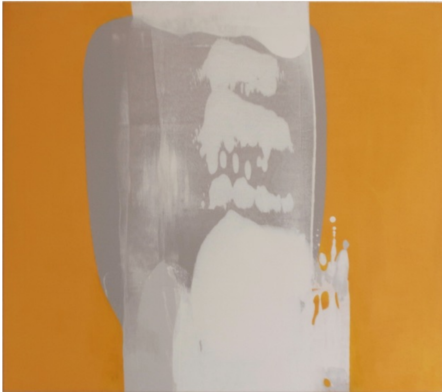
Abstract Painting Y/G/W, 75x85 cm, acrylic on canvas, 2015, POA