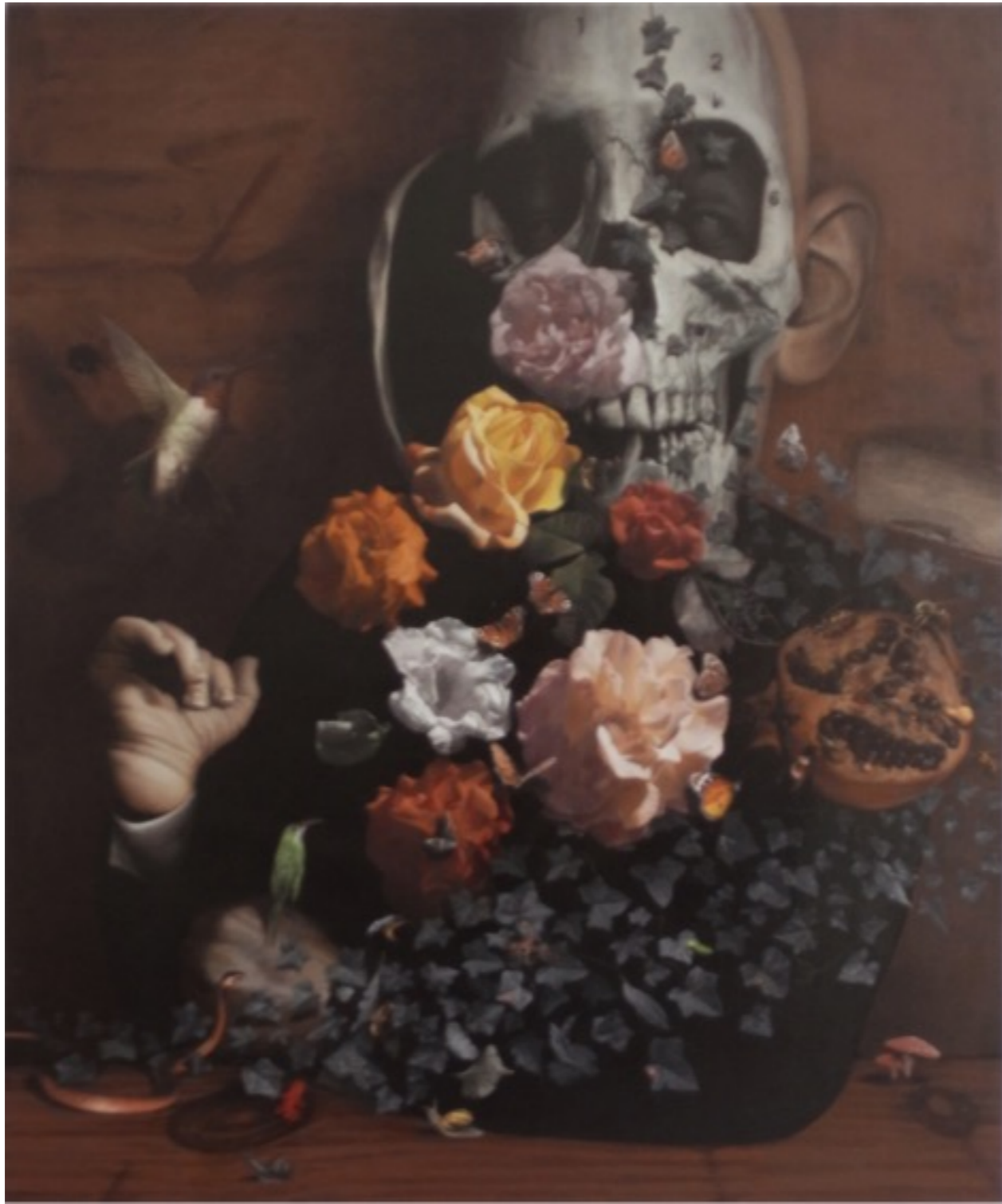
Forbidden Fruit Op.10, 60x50 cm, acrylic on Panel Board, 2015, POA