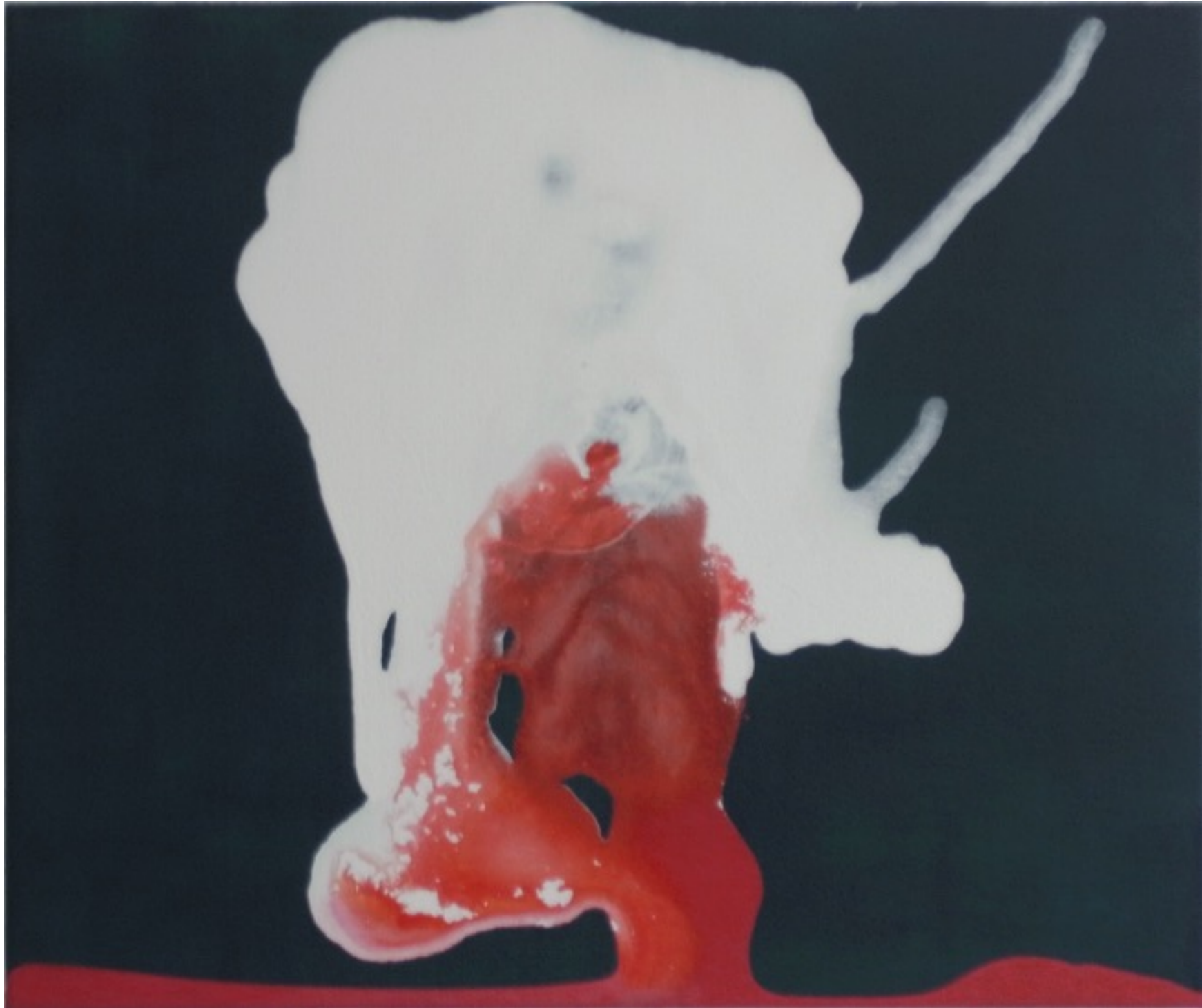
Abstract Painting, dG/W/R, 51x61 cm, acrylic on canvas, 2015, POA