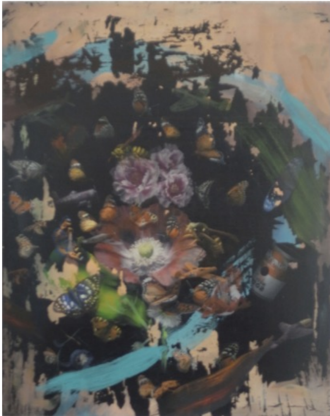
Rock and roll, 50x40 cm, acrylic and oil on Panel, 2014, (Framed), POA