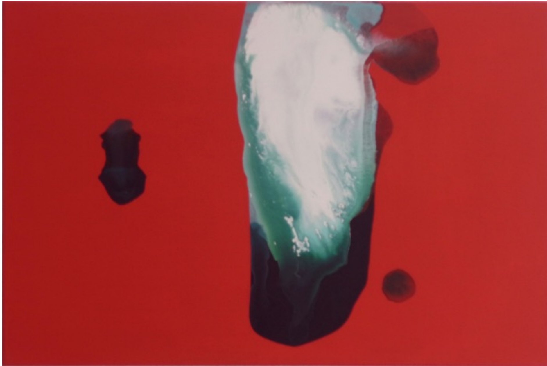
Abstract Painting LR/G/W, 50,5x76 cm, acrylic on canvas, 2015, POA