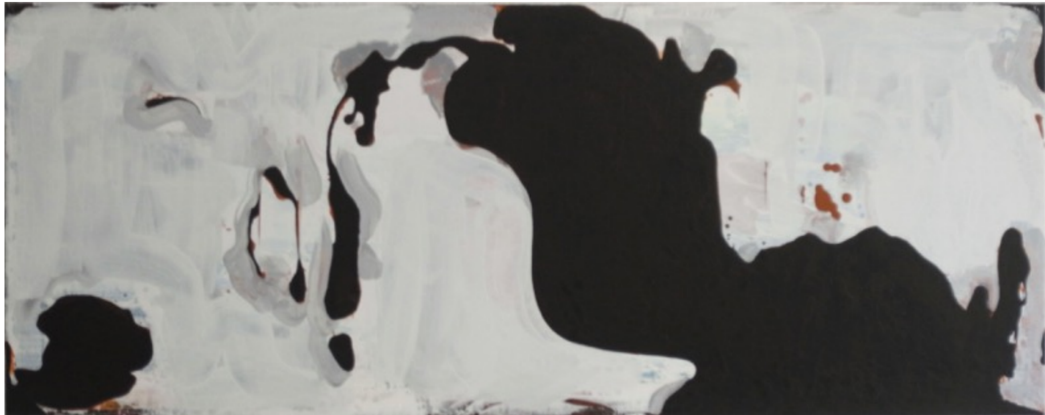
Abstract Painting B/W, 99,5 x 39,5 cm, acrylic on canvas, 2015, POA