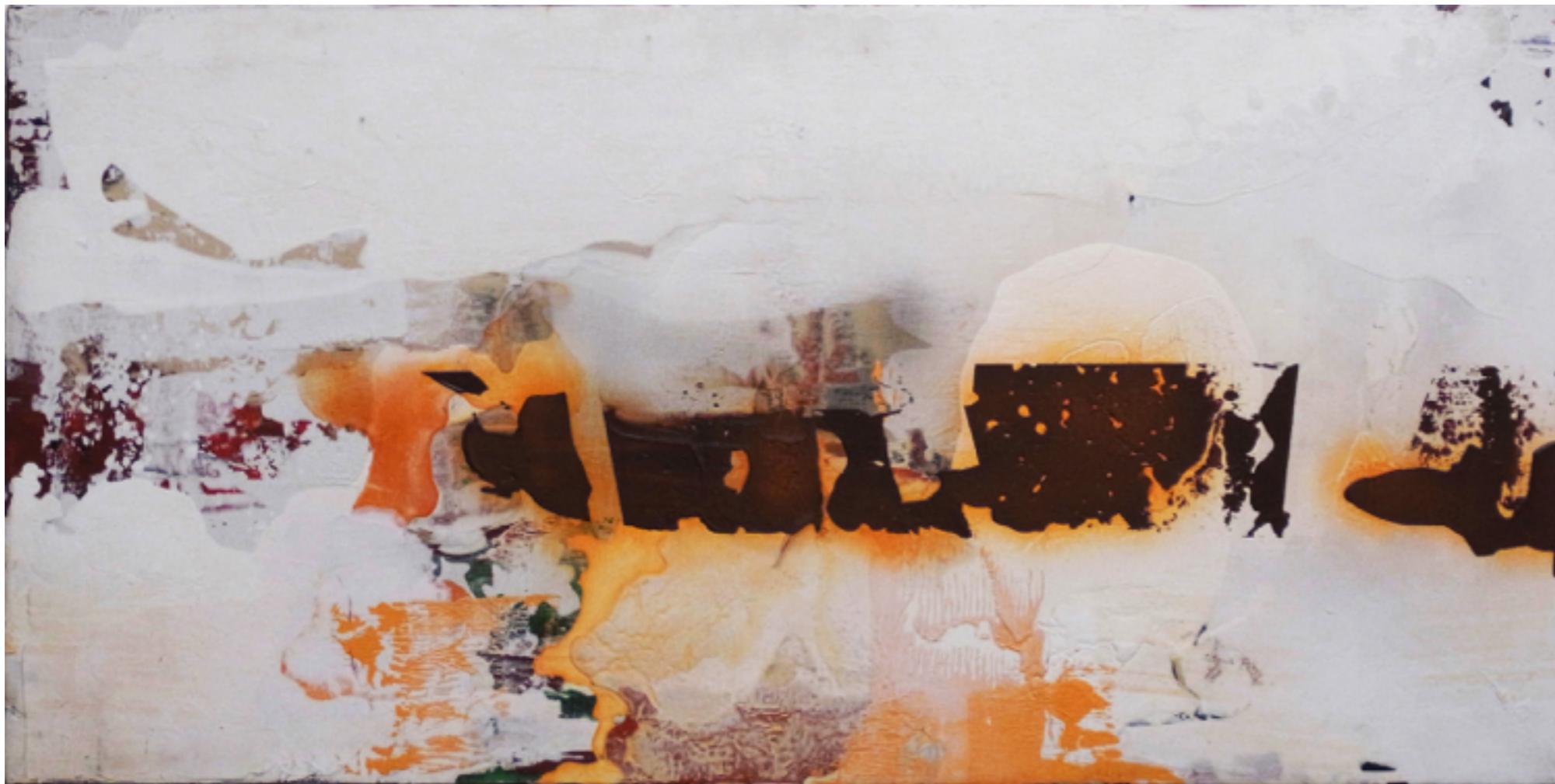
Abstract Painting Layers op.2, 45.2x90.5 cm, acrylic and oil on canvas, 2011, POA