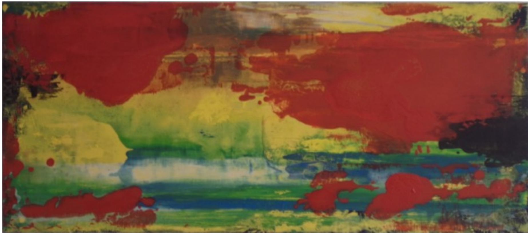
Abstract Painting R/Y/BG, 44.5x101cm, acrylic on canvas, 2015, POA